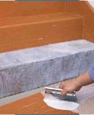
Applying Ultrabond Aqua-Contact on the back of PVC flooring