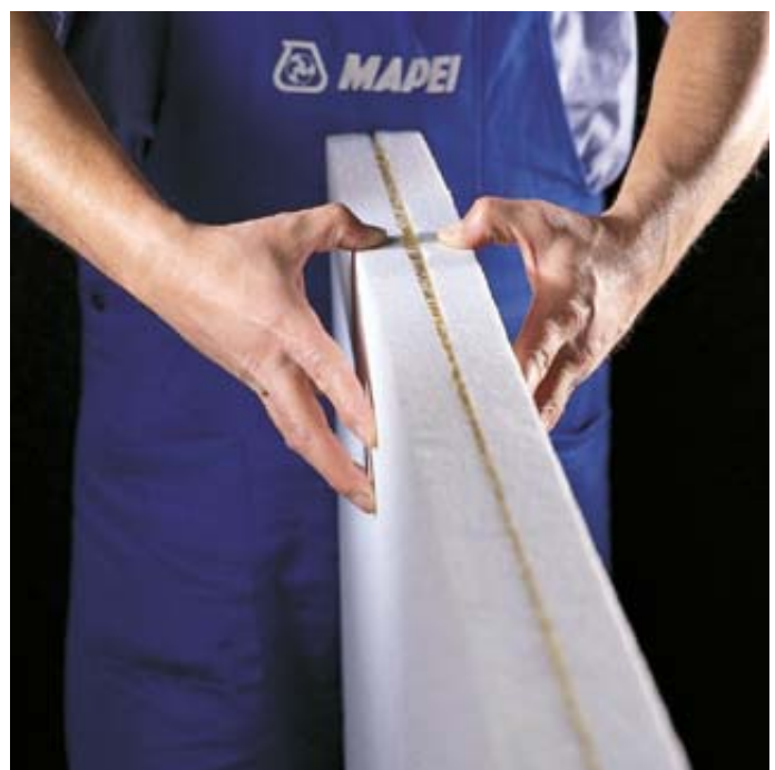
Bonding polystyrene foam panels

All relevant references of the product are available upon request