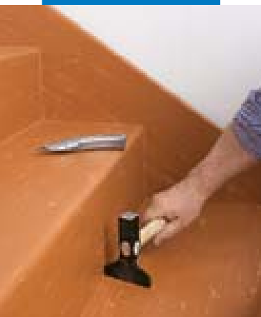
Smoothing PVC floor covering

screeds over bare ground must be poured over a vapour barrier to prevent rising damp.