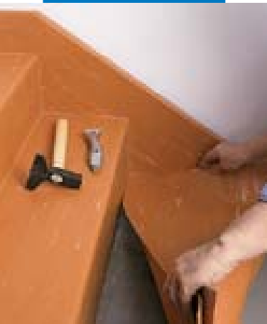
Laying PVC flooring