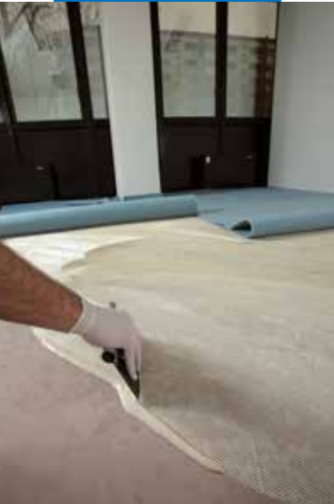
Applying Ultrabond Eco 170