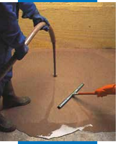
Application of Ultraplan with pump and squeegee