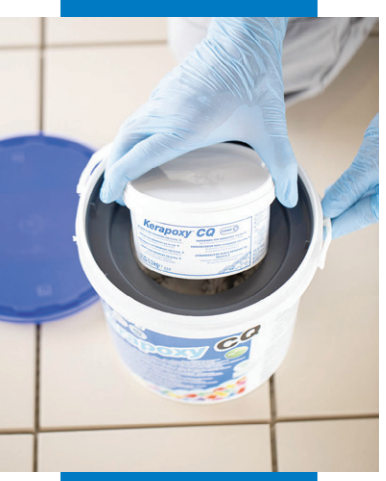
Two-component grout provided in drums containing both components (A and B)