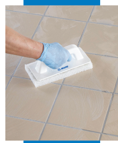
Cleaning joints with Scotch-Brite®