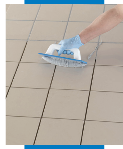
Application of Kerapoxy CQ with Mapei rubber trowel