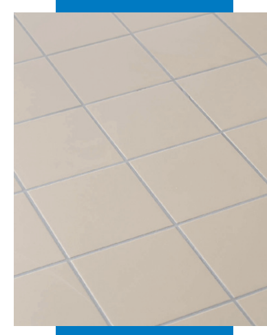
Final effect of a floor grouted with Kerapoxy CQ

The consumption of Kerapoxy CQ varies depending on the size of the joints and the size and thickness of the tiles.