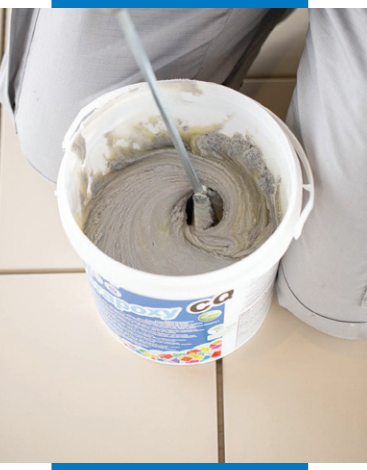
Mix component A+B