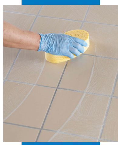
Cleaning and finishing joints with a hard cellulose sponge