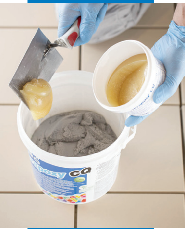
Pour the hardener (component B) in the container of component A