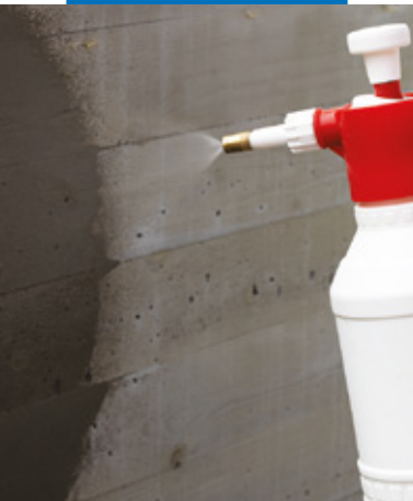
Application of Planiseal WR 100 by spray