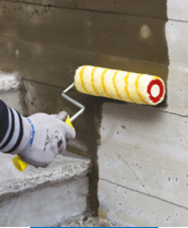
Application of Planiseal WR 100 by roller